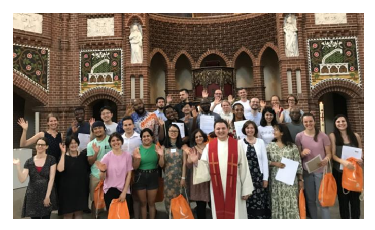
Farewell at the Evaluation and (RE)Integration seminar 2023

The seminar is compulsory for scholarship holders whose funding ends in 2024. The focus will be on reflection on the study or scholarship period, career prospects and peparation for returning home. Information on further funding opportunities will be provided. Some alumns will tell you what happened to them after their scholarship and give you their personal tips. We will also offer you a short career coaching/application training session and a workshop on resilience and mindfulness for challenging times. There will be a preview of alumni opportunities. The highlight will certainly be the festive church service with the presentation of the scholarship certificates, and an intercultural party in the evening.