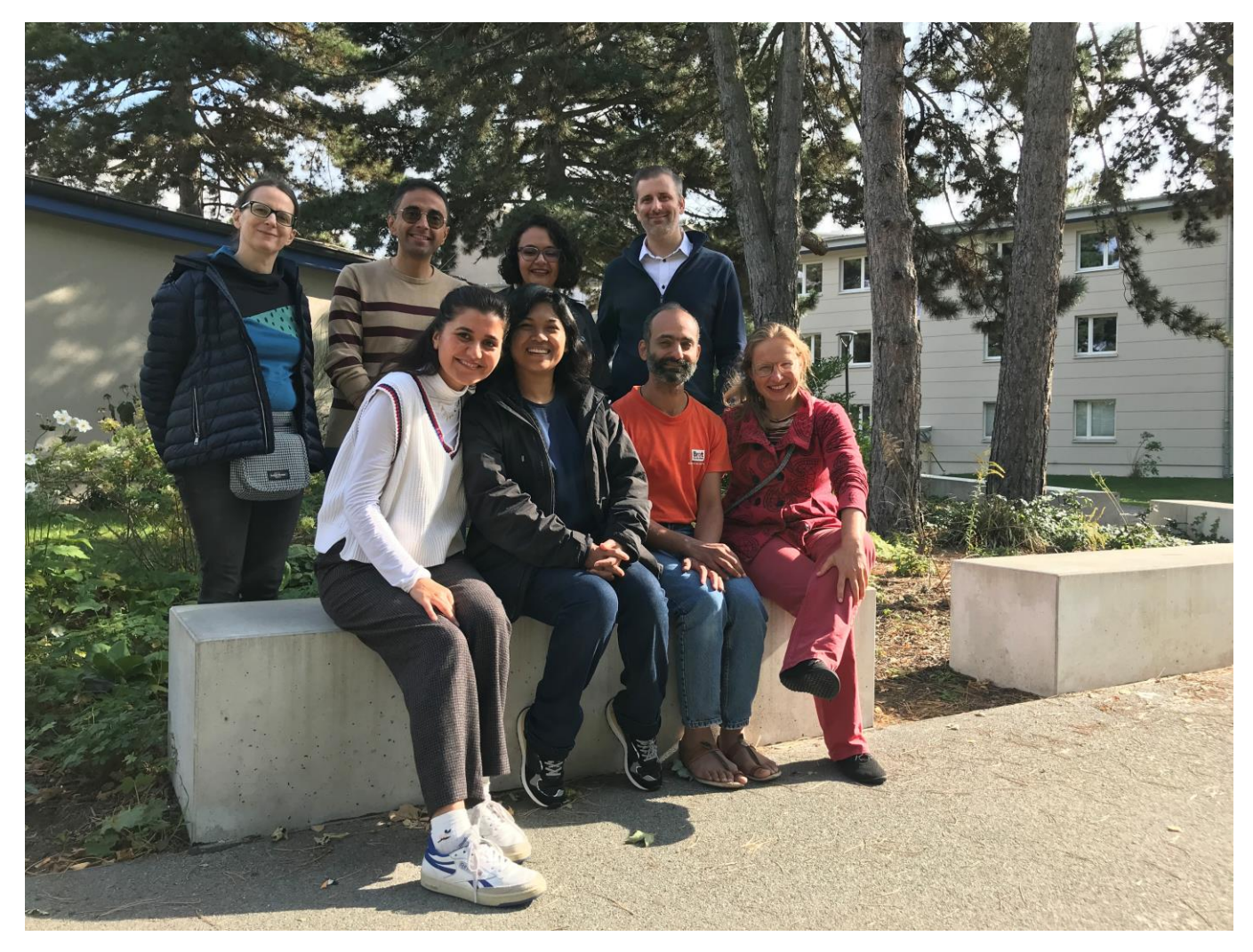
Executive Team meeting in Berlin in October 2023