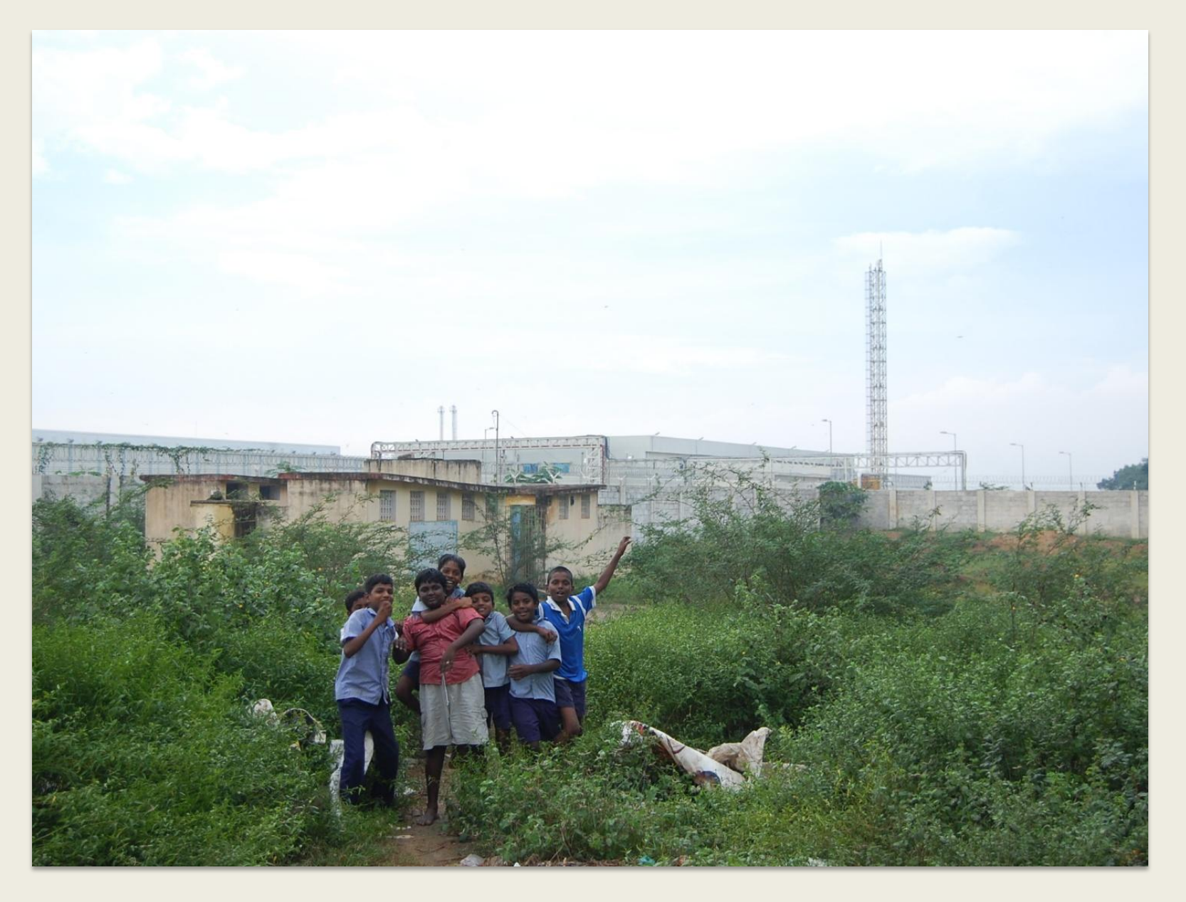
Children lost their playground