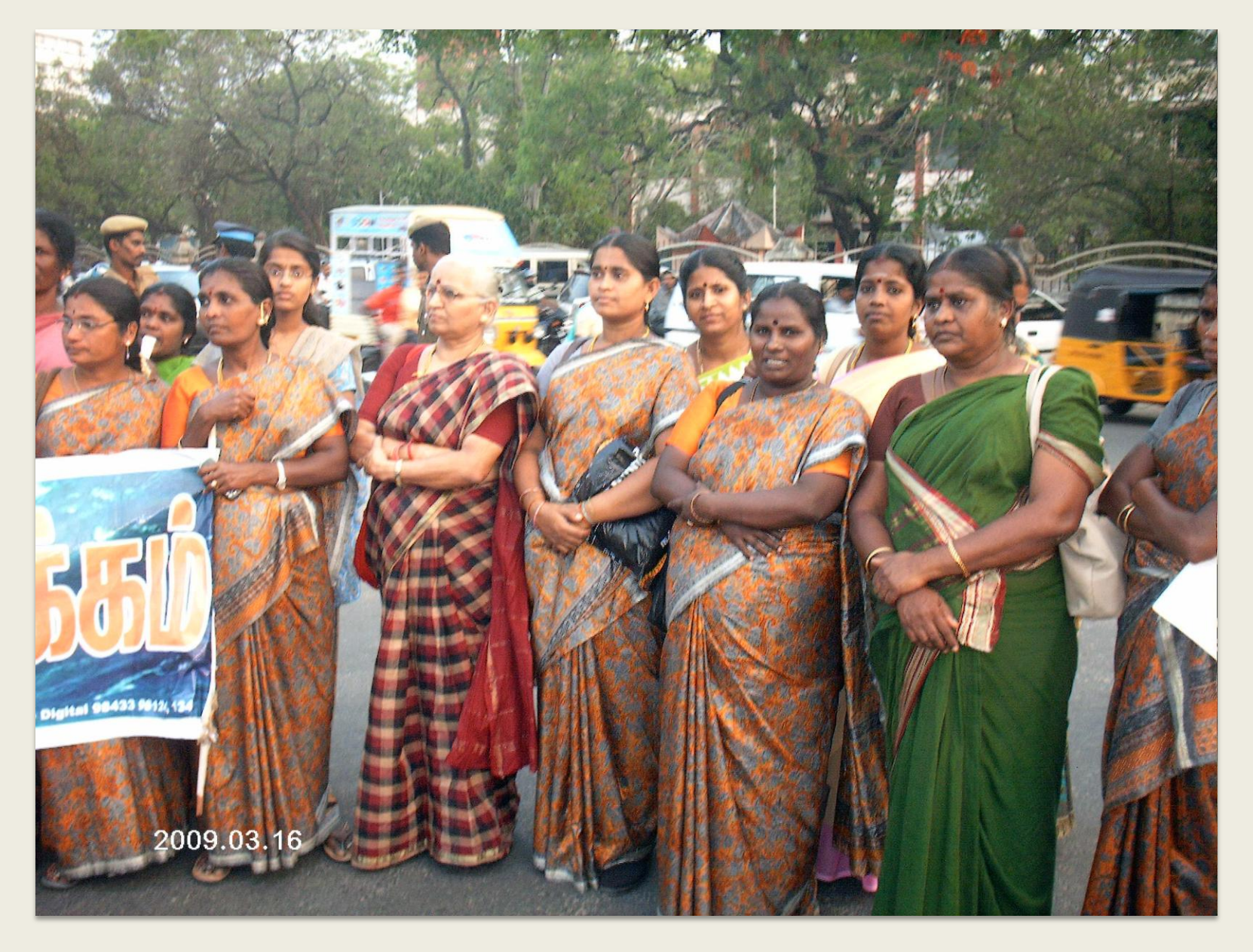
FOOD INSECURITY PROTEST