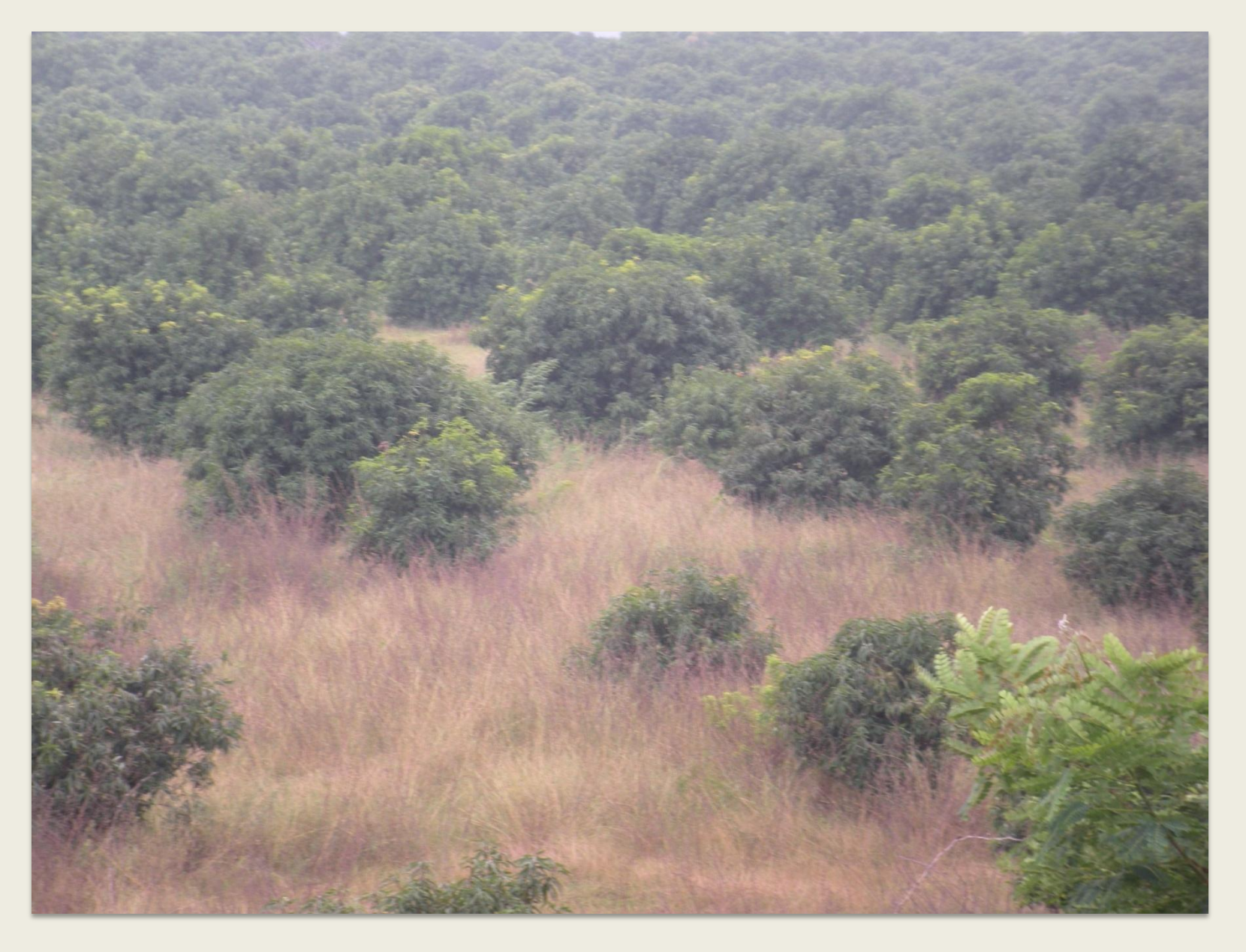
Land Grab at KVRpuram