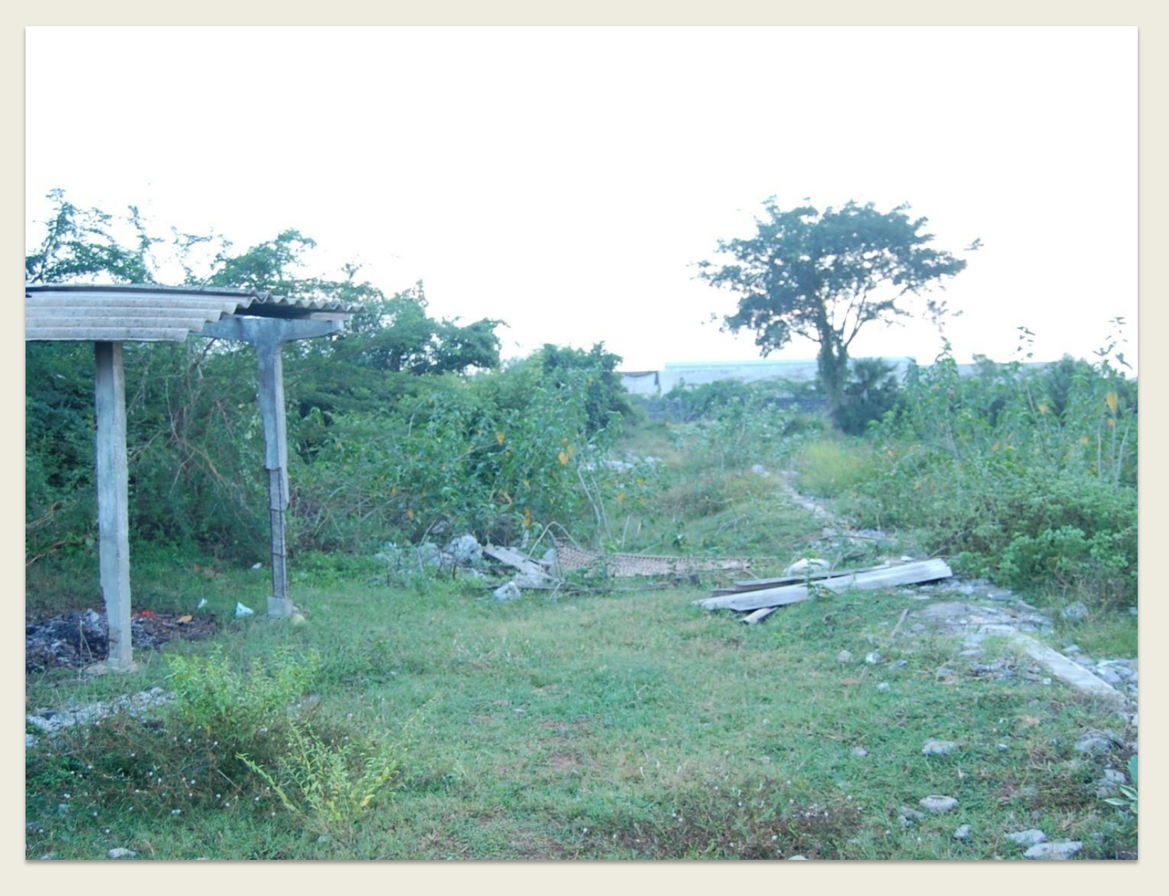
Destroyed Burial ground