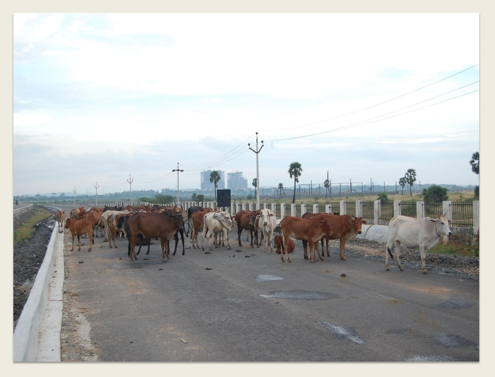
No green pastures