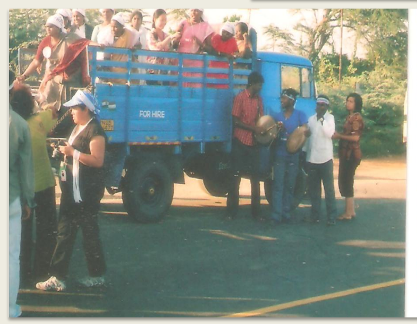
WOMEN'S CARAVAN AGINST SEZ