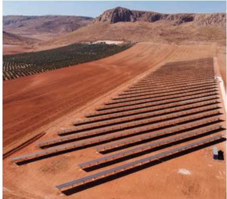
Solar PV plant in Nambia.