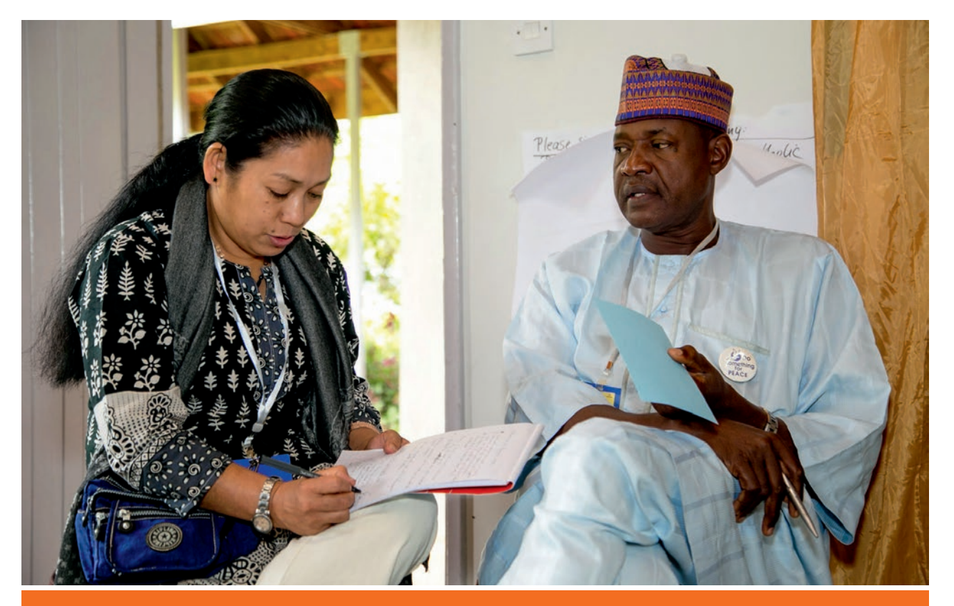
Discussion between workshop participants from Nepal and Nigeria. The interviews conducted in line with the principle of "Empathic Listening" gave insights into Bread for the World partners' ways of working.

The interplay and fusion of state, society and religion make it clear why it is so appealing to 'infect' conflicts over domination and access to power with religious argu-