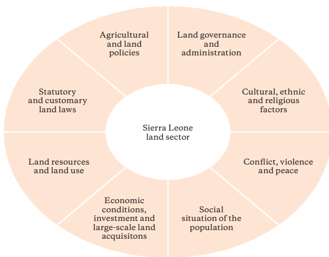
The context of the Sierra Leone land sector: 8 prominent factors

been leased to mostly foreign companies in recent years, mainly for oil palm and sugarcane plantations which produce palm oil and ethanol for export. At the same time Sierra Leone is dependent on the import of staple food. The Government promotes the modernisation of agriculture and considers rural land in Sierra Leone as “underused” or “not used”, although it provides firewood, grazing area, medicinal plants and other goods to its citizens and restores soil fertility as fallow land. Much of the land is subject to customary law through which the land is mostly owned by families, based on oral tradition. The customary law denies the ownership of land to women in most areas. Statutory land laws and formal land titles are only applied in the Western Area around Freetown, where public land administration offices are in place.