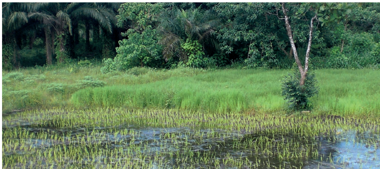
Water and fertile soils attracting foreign investors: wetlands in Sierra Leone near Makeni

national level and international organisations are engaged in the land sector. Most of these organisations are rather specialised and land is not their primary focus but rather indirectly addressed. Their background is food security, environment, women's rights, mining, rural development, slum development, adult education, human rights or other activities. Approximately 50 organisations engaged in the land sector have been identified during the study, but others also work in this field. Many organisations are active in one or two districts only; 11 organisations cover more than two districts.