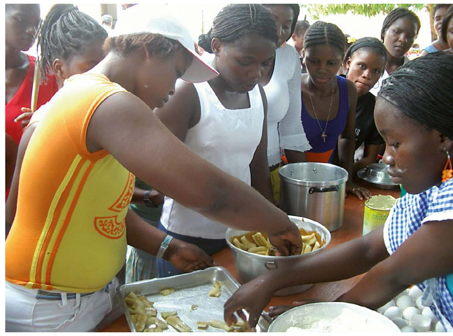
War affected girls and young women at a terre des hommes-project in Angola. Some of them had been abducted or forcibly recruited by rebels during the civil war.

The Federal Government wants to retain the possibility to recruit and train children militarily. This undermines the credibility of the Federal Government which calls upon other states and non-state actors to follow the 18-years-standard in the recruitment process. Instead of taking on a role model in regard to human rights, Germany serves as a negative example and excuse for other armed forces and armed groups to continue to recruit minors. Acknowledging "Straight 18" and raising the minimum age for recruitment for the Bundeswehr would be the right way to proceed.