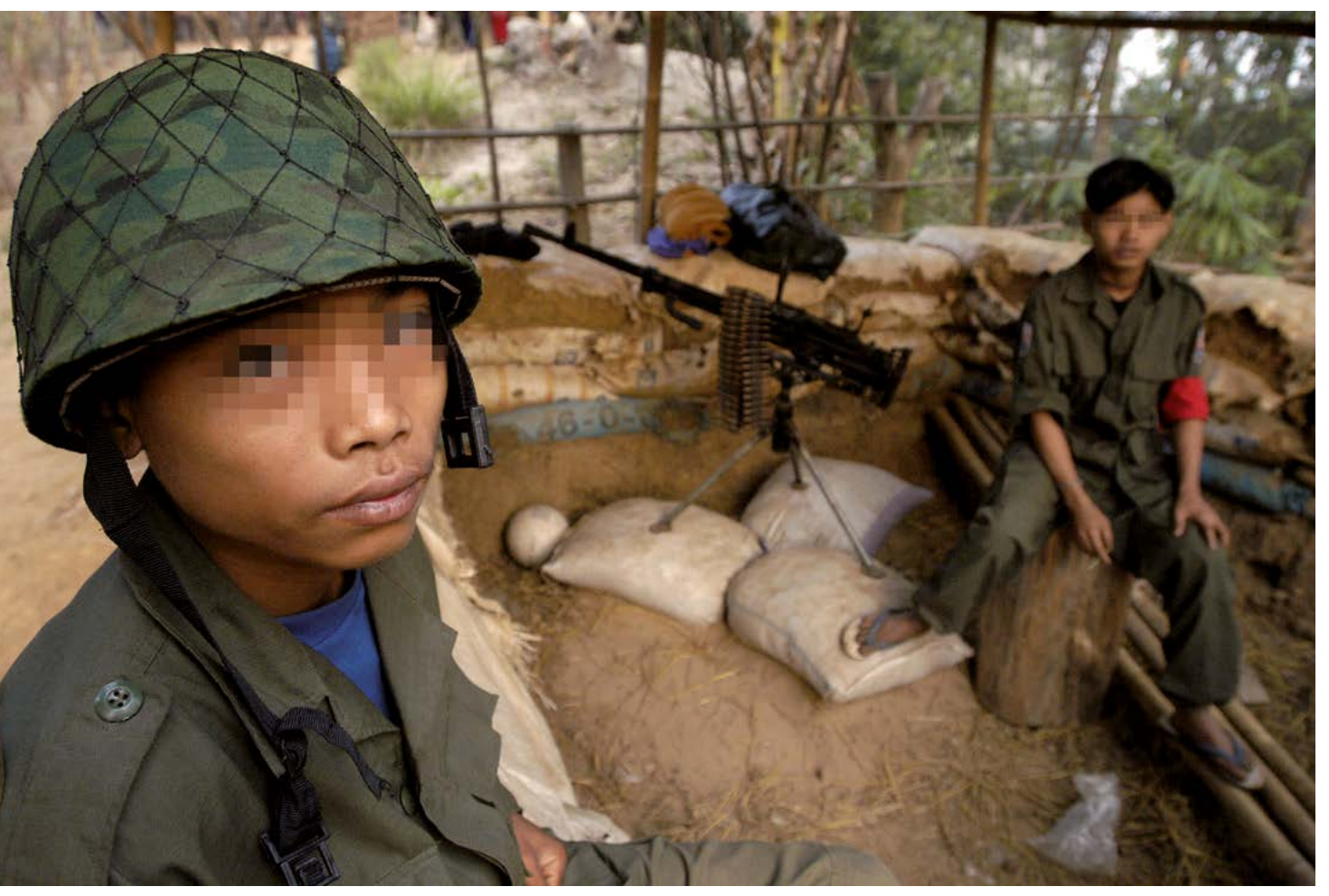
Two young boys man a guard post in Myanmar (Burma). The Burmese Armed Forces and several armed opposition groups abuse children and youth as soldiers.

The evaluation of the annual reports on German arms exports and other statistical sources shows that, despite the ongoing Philippine civil war, exports of weapons were licensed by the German government. Primarily exports of small arms, light weapons and their ammunition and technology were authorized. Since 2004, the Federal Government has licensed the export of 800 assault rifles, 480 submachine guns, 31 grenade launcher pistols and 6 light machine guns. In addition, various parts for these weapons, such as for 7,700 parts for rifles, were licensed. Furthermore, at least 150,000 rounds for submachine guns and 130,000 rounds for rifles were licensed for export. If one looks at the DESTATIS figures, more than 11 tons of rifle ammunition and parts thereof as well as 4,300 "civilian" pistols and almost 900 "civilian" rifles and carbines have been exported since 2002.