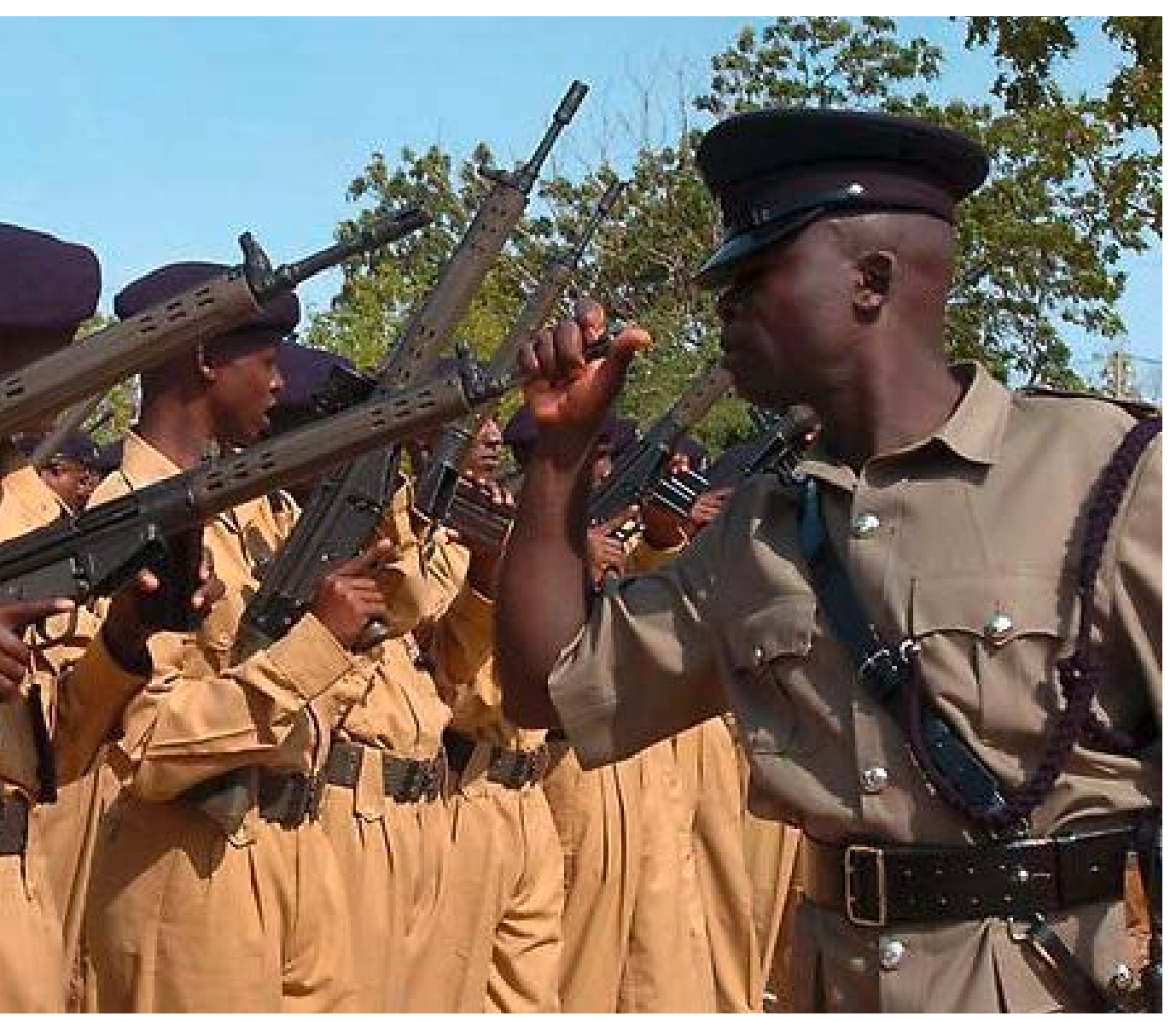
In Manyani, a Kenyan police officer inspects the G<sub>3</sub>-rifles of Somali police recruits. The G<sub>3</sub> is produced by the German arms manufacturer Heckler & Koch.