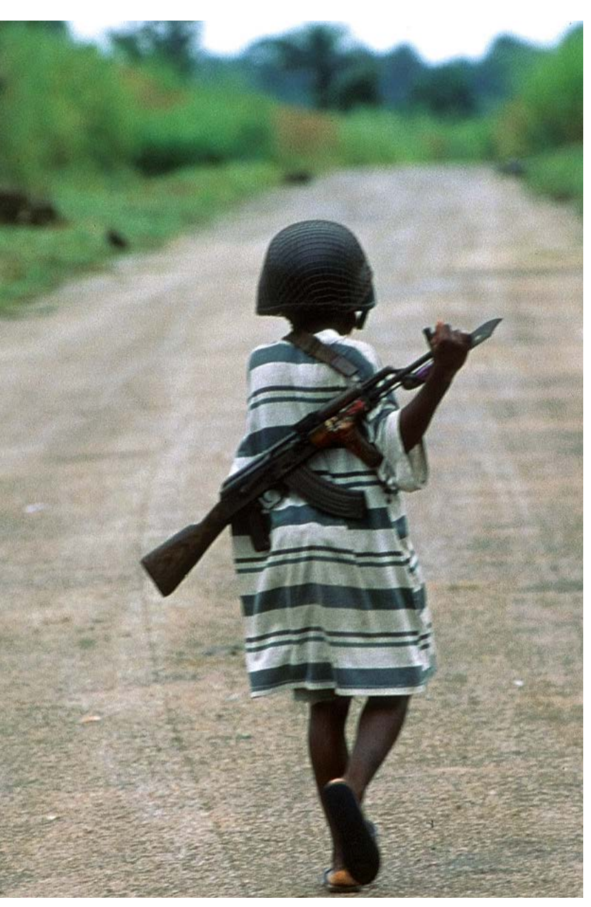
Child Soldier of the rebel group RUF with Kalashnikow at a checkpoint near Makeni, Sierra Leone, 1999