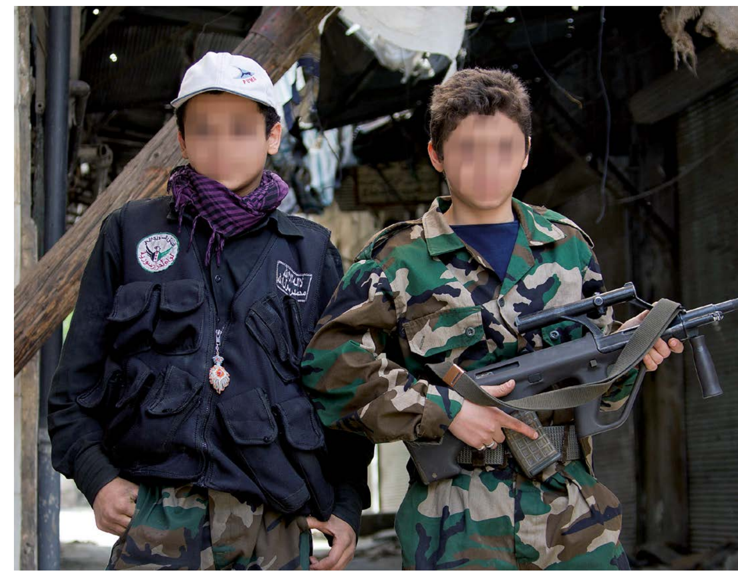
Free Syrian army's young fighters pose in 2013 as they hold positions near the front line.

"Child soldiers", "small arms" and "arms exports" are common, colloquial terms. Nevertheless, these terms – for the most part – lack a universally accepted political and legal definition. Therefore, the first part of this study will focus on the international efforts in regard to a universal definition of "child soldiers" and "small arms and light weapons", including the relevant norms, which subsequently can then be applied for Germany. Following this, an overview will be given on the main laws, agreements and regulations relevant for German arms export licensing procedures.