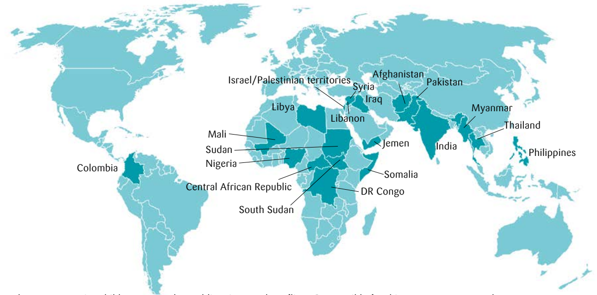
Figure 2: Countries where children are used as soldiers in armed conflicts

In at least 20 countries children are used as soldiers in armed conflicts. Responsible for this are non-state armed groups (in 20 countries) and state armed forces (in 8 countries). Figure: terre des hommes. Source: UN Secretary-General's Annual Report on Children in Armed Conflict, April 2016