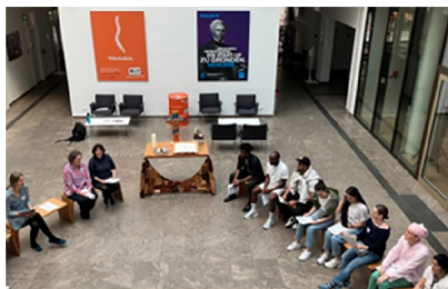
Farewell at the evaluation and (re)integration seminar 2025

The seminar is compulsory for scholarship holders whose funding ends in 2026. The focus will be on reflection on the study or scholarship period, career prospects and preparation for returning home. Information on further funding opportunities will be provided. Some alumni will tell you what happened to them after their scholarship and give you their personal tips. We will also offer you a short career coaching/application training session and a workshop on resilience and mindfulness for challenging times. There will be a preview of alumni opportunities. The highlight will certainly be the festive church service with the presentation of the scholarship certificates and an intercultural party in the evening.