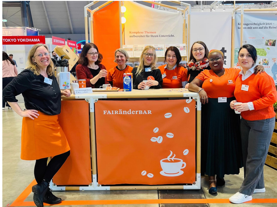
At the exhibition stand of Brot für die Welt in Stuttgart, didacta 2025

Scholarship holders interested in education are invited to visit the fair as a small STIPE delegation. We plan to strengthen the presence of Brot für die Welt at the fair and present educational materials at our own stand. We will also participate in panels or workshops and you may present your educational topic shortly on stage. Networking with staff members of Brot für die Welt, and various German educational actors, e.g. school-teachers and NGOs will be possible. Participation is only meaningful if you have a good knowledge of German.