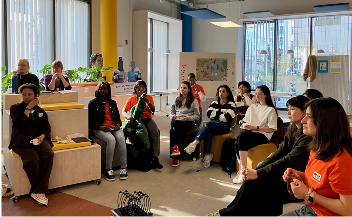
Introductory seminar in March 2025

In the following programme we list all events as we can foresee them in late 2025. Some, especially external events, are added spontaneously, especially if they take place online. You can find the latest information on EASY and we will send you invitations by email at least 4 weeks before any event.