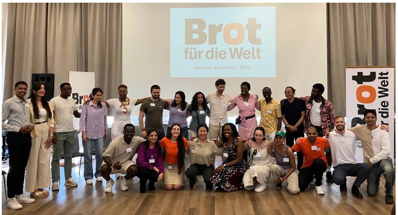
The outgoing Executive Team (2024-25) seated and the incoming Executive Team (2025-26) standing at the General Assembly in June 2025, below power women in the Executive Team