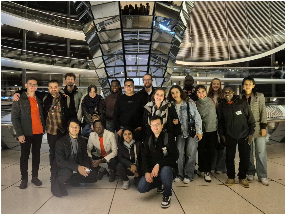
New Scholarship holders at the German Parliament in 2025

The mandatory seminar is aimed at new scholarship holders in all scholarship programs. It provides orientation in regards to the program, the course of funding and the STIPE scholarship support program. Participants have the opportunity of getting to know Brot für die Welt and meeting the supporting staff in person. The Executive Team will also be on hand to advise them. As a day trip to Lutherstadt Wittenberg is planned, there will be an opportunity to follow in the footsteps of Martin Luther and breathe in history at some of the original sites of the Reformation.