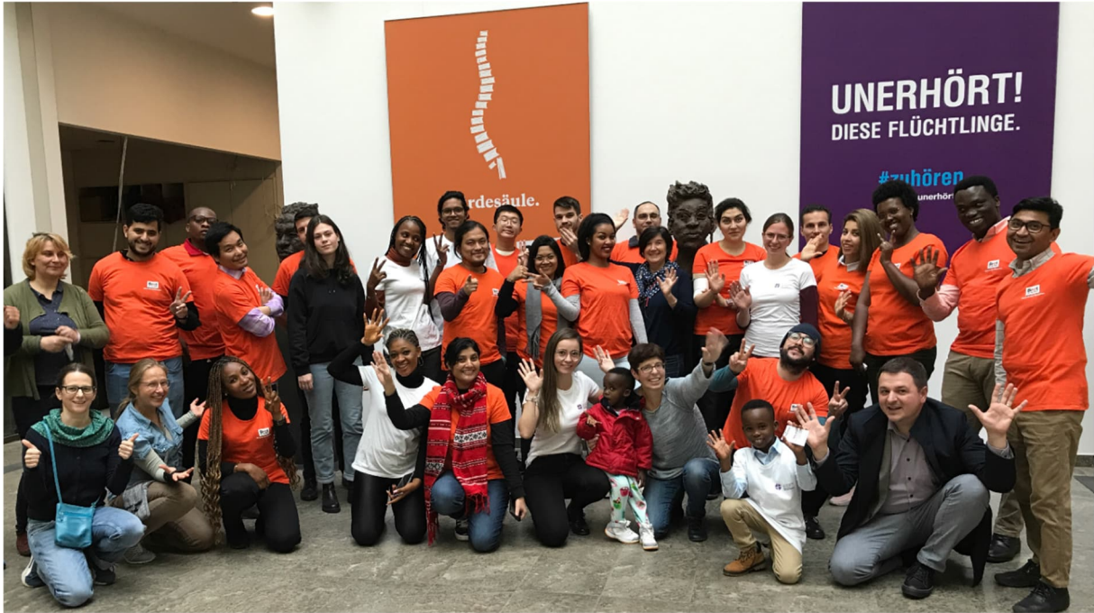
Introductory seminar in September 2022

In the following program, we list all events just as we could foresee them in September 2022: online in the beginning of 2023 and then mainly in presence. However, the Corona situation in Germany may change at any time. We are preparing to be able to offer all events online. The dates will remain the same!