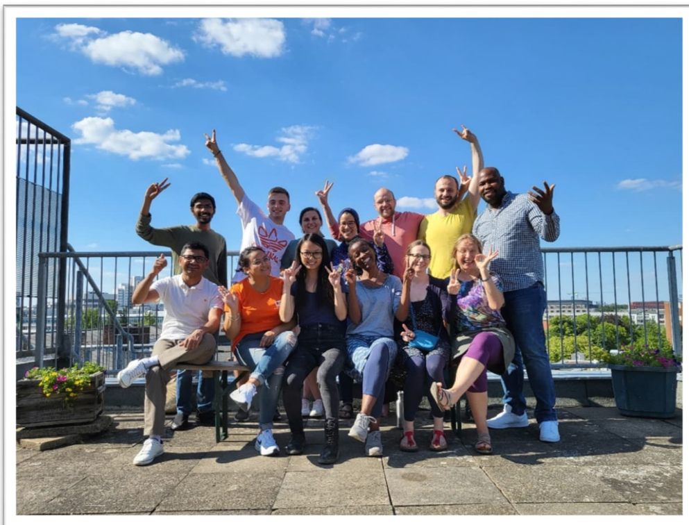
Executive Team meeting in Berlin in July 2022