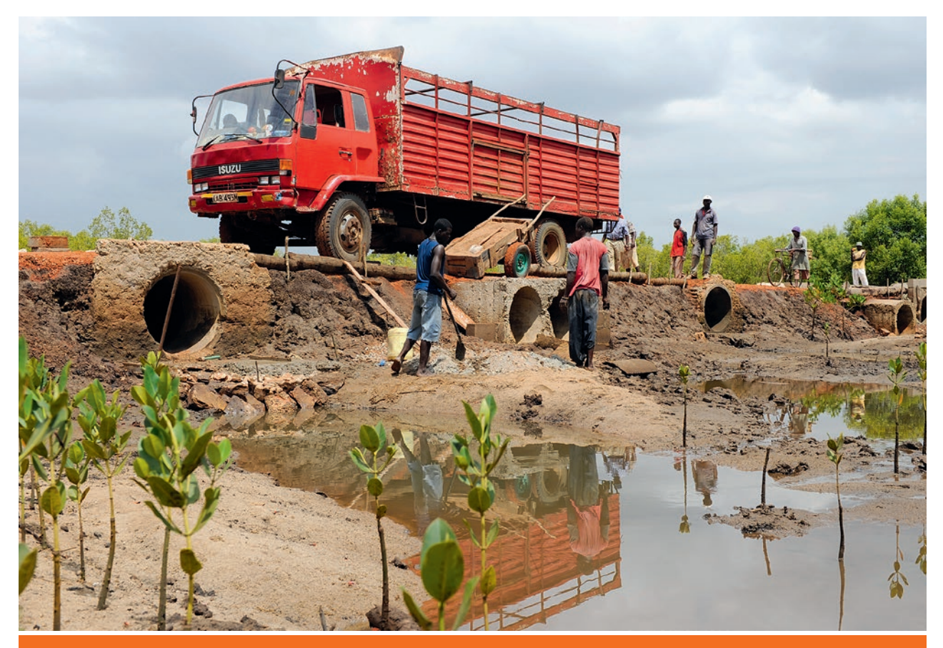
Well-run development banks can ensure long-term finance for key development sectors and sustainable infrastructure like building roads to connect small and remote villages and enable their market access. Here the construction of a road between villages near Mombasa in Kenya.

cial institutions, as they focus mainly or exclusively on short-term profits, and tend not to be interested either in past experience or in future externalities. Development banks therefore need to help fill the gap.