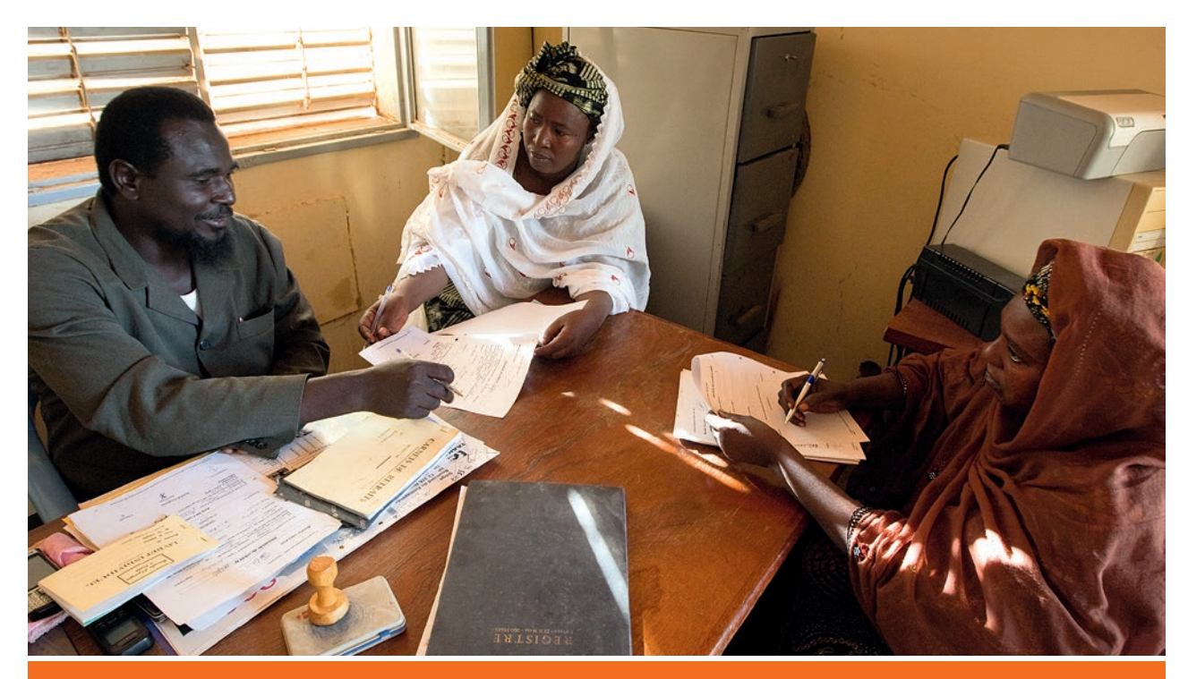
Development banks can help channel sufficiently low cost credit to small and medium enterprises. For a development bank to be "well-run", it must keep narrow private and political vested interests outside of its decision-making process, thus avoiding corruption. Its hiring of staff should be transparent, and based on merit, and it must consult with people, who could be potentially negatively affected. Here a credit committee in Niamey, Niger in Africa.

bonds from different developing and emerging economies, and sell them in the capital markets, where they would benefit from benefits of diversification.