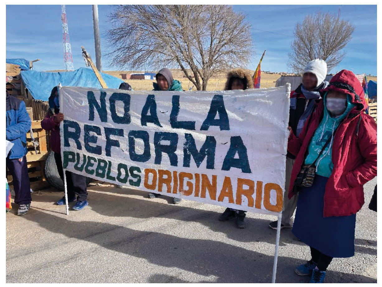
"No to the reform. Indigenous peoples". Demonstration of indigenous communities against constitutional reform held on national route 9 at the access to La Quiaca. August 23, 2023

The violation of the rights to free, prior and informed consultation and to participation continued throughout the constitutional reform process, despite the express requests of the indigenous peoples to have mechanisms for the effective exercise of their rights. In this regard, the international fact-finding mission had access to a petition, submitted on 31 May 2023, in which representatives of the Guaraní, Ocloya, Tilian, Omaguaca, Kolla, Quechua and Chicha peoples asked to be heard by the pro-government bloc of the Constitutional Convention, as well as for the application of international principles on the right to free, prior and informed consultation.