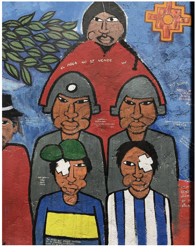
Mural alluding to eye injuries caused by the arbitrary use of force by the Provincial Police of Jujuy. Purmamarca, August 2023.

The victim told the media that, in the chaos of the dispersal, he ran to the side of the road to take cover. When he saw that the police officers were retreating, he stood up, at which point he was shot in the eye.<sup>134</sup> He said that he was shot at close range and another protester helped him by throwing him to the ground, as the police continued to shoot at him.<sup>135</sup> The minor was reportedly hit by a total of seven rubber bullets, two of which were aimed at his face and the remaining five at his arms and legs.