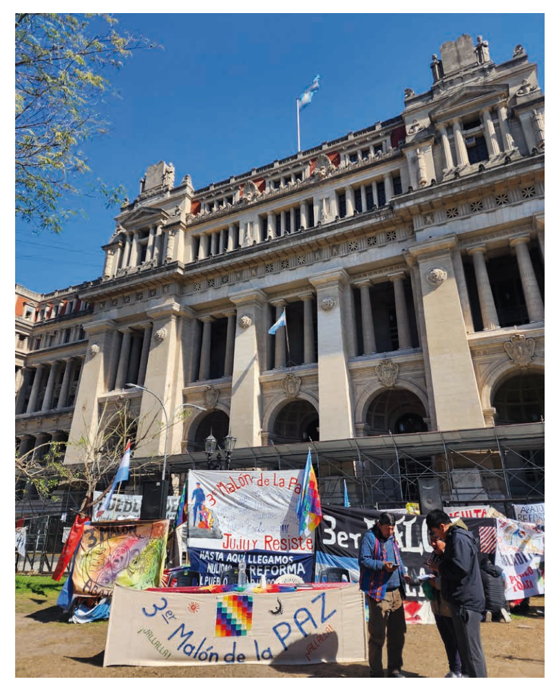
Demonstration of the Third Malón of Peace at the Supreme Court in Buenos Aires. August 26, 2023

On 14 June 2023, indigenous peoples undertook the third Malón de la Paz. <sup>120</sup> Under the slogan "Up with the Wiphala, down with the reform" and "Water is worth more than lithium", various indigenous communities marched to demand respect for their rights in the constitutional reform process. The mobilisation that began in Abra Pampa, also known as the capital of the Puna region, ended on 16 June 2023 at the provincial Legislative Assembly in San Salvador de Jujuy. Upon arriving in the provincial capital, the indigenous peoples decided to continue with the public demonstrations indefinitely, after learning that, that same day, the Constitutional Convention had approved the constitutional reform project behind closed doors.