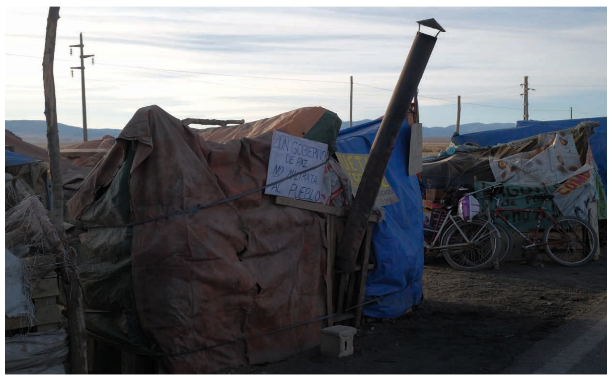
«A government of peace does not mistreat the people». Permanent roadside camps for indigenous peoples. August 2023

After the withdrawal of these provisions and the swearing in of the provincial Constitution, indigenous protests continued. The international fact-finding mission found that, more than two months after the adoption of the new constitutional text, a roadblock was still in place in Abra Pampa and around 67 communities from La Quiaca, Salinas Grandes, Susques, Humahuaca, San Roque and Purmamarca remained active. Some of them, such as the communities of Salinas Grandes and San Roque, set up permanent roadside camps, from which they informed passers-by of their resistance to the approved constitutional reform.