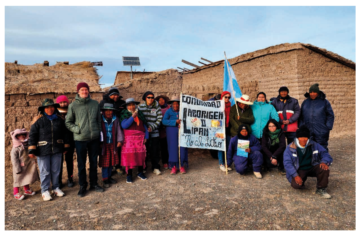
Visit of the international observation mission to the Kolla Lipán indigenous community in Salinas Grandes. August, 2023

According to testimonies gathered in meetings with community representatives, as well as documents handed over to the international fact-finding mission, the project was approved without prior information, during a meeting held with a few people from the community, convened by the Municipal Commissioner of El Moreno, with the presence of the provincial government and representatives of the companies JEMSE and Lithos S.A. The representative institutions of the community did not participate in the meeting.