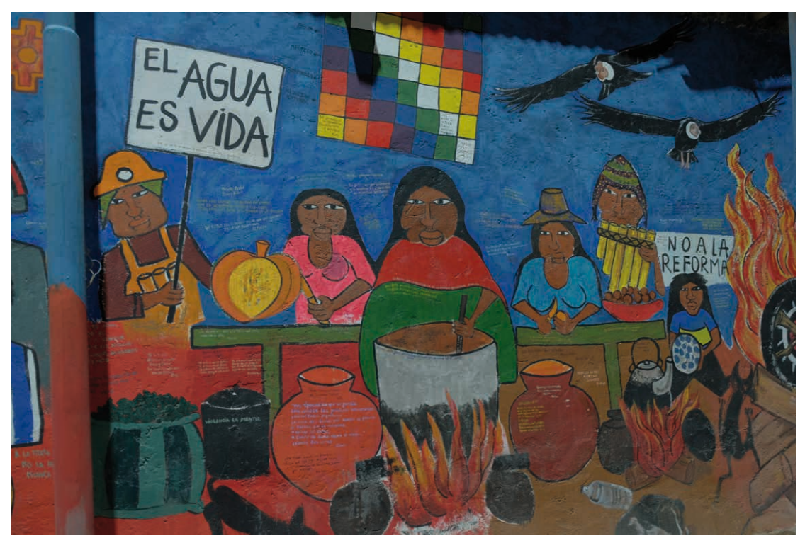
«Water is life. No to the reform». Mural alluding to the constitutional reform, with messages aimed at respecting the right to water. Purmamarca, August 2023

The new constitutional provision does not adequately address integrated management of basins, nor does it recognise the traditional uses of water by indigenous communities. On the contrary, it prioritises the large-scale exploitation of water sources, thus making it easier for water to be used in lithium extraction projects, which are also called "water mega-mining".<sup>94</sup>