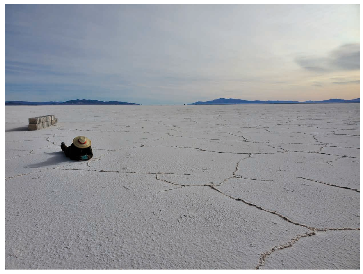
Salinas Grandes Andean Salt Flat. August 2023

The Andean salt flats of Argentina, Chile and Bolivia hold approximately 70% of world reserves of lithium in the form of brines.<sup>44</sup> These underground deposits of water and salts within the salt flats have high concentrations of lithium, and their exploitation is the easiest and most economically profitable of all methods for extracting the mineral. For this reason, the Puna region shared by the three countries is also known as the "Lithium Triangle".<sup>45</sup>