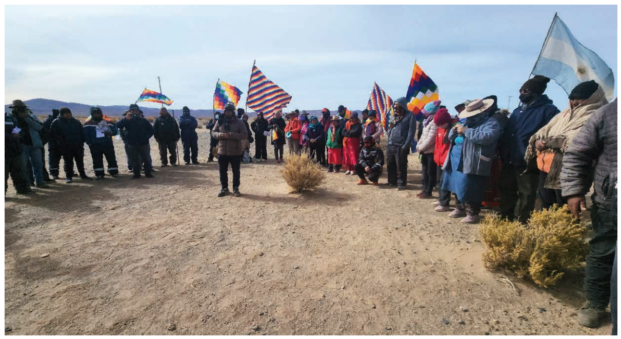
Demonstrators from the indigenous communities of the Salinas Grandes Basin and Laguna de Guayatayoc wave whipalas at the junction of Abrapampa and Moreno. August 23, 2023.

In Purmamarca, the mission gathered testimonies indicating the desecration of sacred spaces and disrespect for indigenous cultural identity, including the removal of symbols such as the Wiphala<sup>182</sup> or Viltipoco.<sup>183</sup> According to one of the testimonies received, "Sacred spaces were desecrated, they took down the Wiphala, they removed Viltipoco from the square, they want to erase our culture."