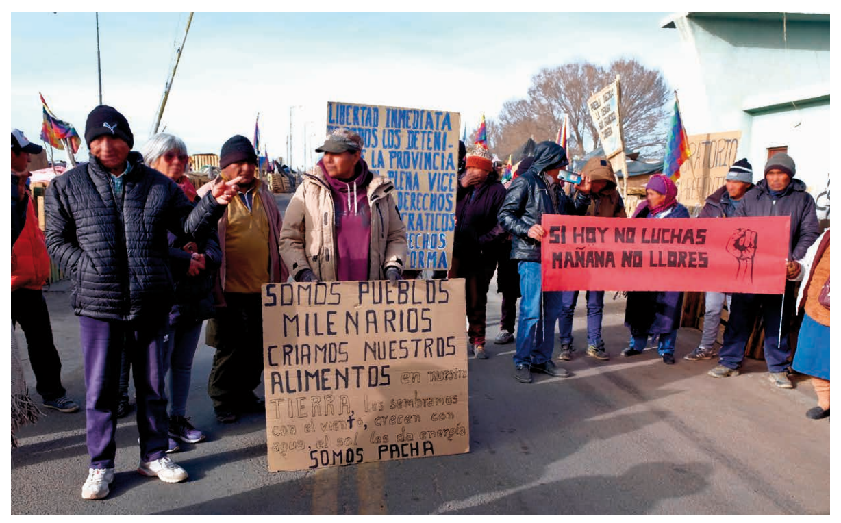
"We are millenary peoples. We raise our food on our land, we sow it with the wind, it grows with the water, the sun gives it energy. We are Pacha". Demonstration of indigenous peoples of the Puna against the constitutional reform. August 2023

An indigenous leader from Abra Pampa underlined the lack of legitimacy of the new provincial Constitution, given the exclusion of indigenous communities from crucial decisions on the future of their ancestral territories: "They steal our wealth, they give us crumbs. They pollute our land. We have nothing, this constitutional reform is not for us; we have been excluded from the whole process at every step and we don't have the capacity to change it or even get help from the courts because they will just do whatever the Governor wants to do."