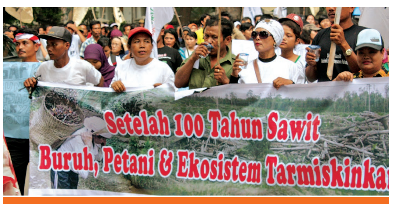
Sumatra, Indonesia: A demonstration by plantation workers: "After 100 years of oil palm plantations, the workers, farmers and ecosystem are exhausted."

• to take action to protect affected communities and land rights activists, e.g. through appropriate media reporting; to create opportunities for anonymous publication of reports on land acquisitions and human rights abuses in order to protect organisations and individuals with a commitment to reporting these issues; and to strengthen international organisations' protective role at the local level;