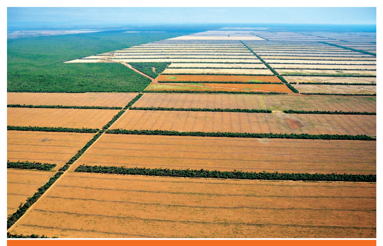
Gran Chaco, Argentina: Indigenous communities are being deprived of their livelihoods. The forest is being cleared and replaced with monocultures, stretching as far as the eye can see.