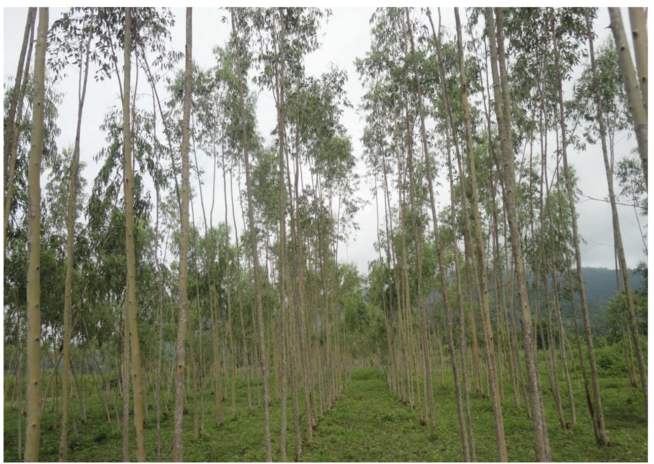
Clean Development Mechanism (CDM) supported monocultures typically involve local communities and are challenging to implement. Experience with a CDM forestry project in India has shown that farmers bear the financial risk in cases where revenues from carbon credits do not materialise.