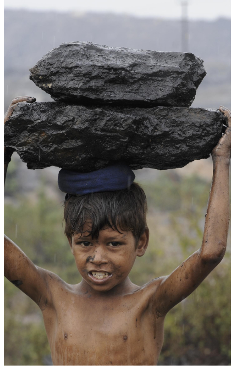
The CDM allows new coal plants to earn carbon credits for claimed improvements in power plant efficiency. However, coal projects do not belong in the CDM, because they conflict with the CDM's sustainability objectives by inflicting toxic burdens on local populations and ecosystems, they undermine climate mitigation goals by locking in billions of tons of CO2 emissions over decades to come, and they would have been built in the absence of the CDM and hence do not generate carbon credits that represent real emissions reductions. This image shows a young boy in India collecting coal.

It is still unclear what types of offset credits would be approved for compliance under an avi-