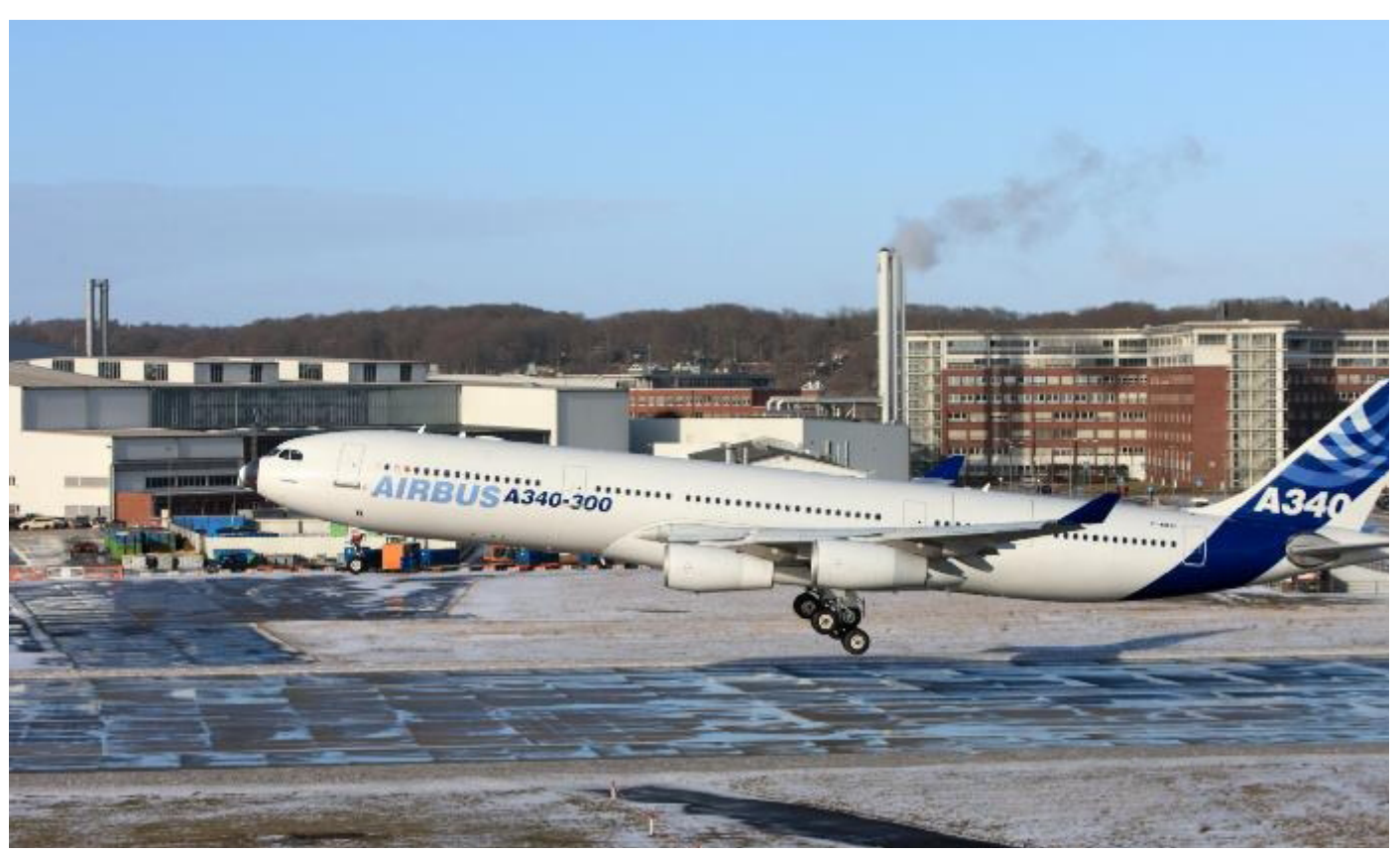
The EU decided that all flights arriving to and flying from the EU would have to account for their emissions