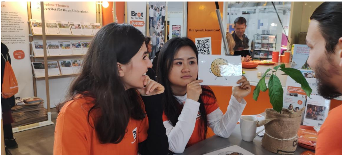
Am Brot für die Welt Stand bei der didacta im März 2023

All scholarship holders interested in education are invited to visit the fair as a small STIPE delegation. We plan to strengthen the presence of Brot für die Welt at the fair and present educational materials at our own stand. We will also participate in workshops and discussions. Networking with different educational actors and NGOs will be possible.