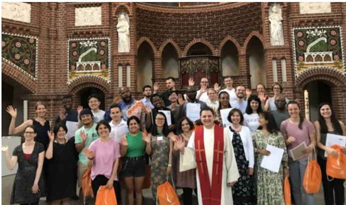
Farewell at the Evaluation and (RE)Integration seminar 2023

The seminar is compulsory for scholarship holders whose funding ends in 2024. The focus will be on reflection on the study or scholarship period, career prospects and preparation for returning home. Information on further funding opportunities will be provided. Some alumni will tell you what happened to them after their scholarship and give you their personal tips. We will also offer you a short career coaching/application training session and a workshop on resilience and mindfulness for challenging times. There will be a preview of alumni opportunities. The highlight will certainly be the festive church service with the presentation of the scholarship certificates, and an intercultural party in the evening.