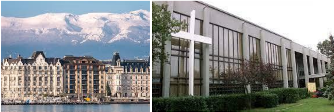
Geneva with the headquarters of the Lutheran World Federation

Geneva, as the seat of the World Council of Churches and the Lutheran World Federation, as the city of the Calvinist Reformation, and as the location of many important international organisations - among them UNHCR, the Red Cross and Act Alliance - offers numerous ecumenical learning and networking opportunities. Together with the Ecumenical Institute in Bossey, Protestant and Catholic scholarship providers are planning this trip. PhD students in the field of theology and ecumenism or leadership scholarship holders are particularly invited.