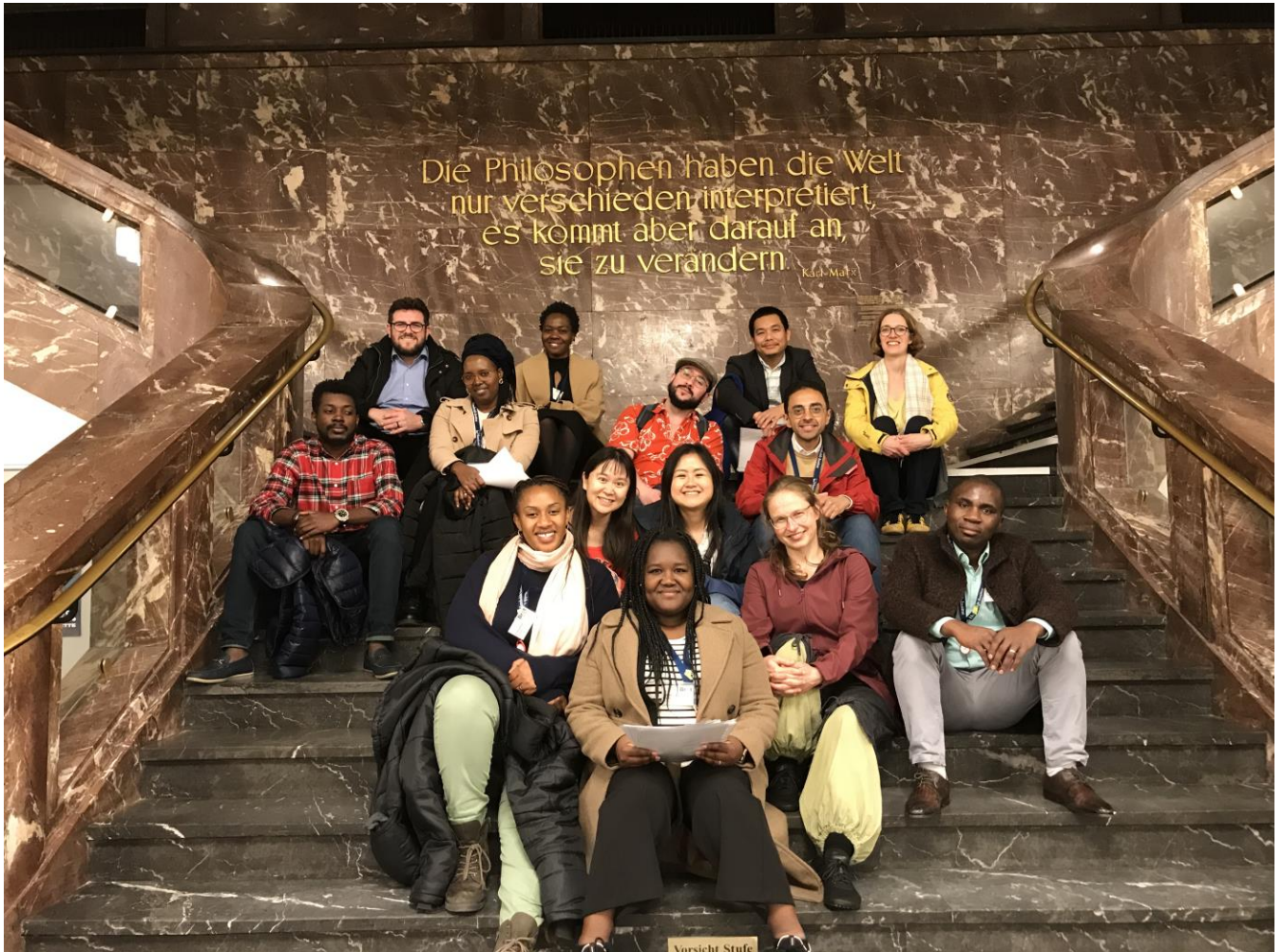
Leadership-Seminar in April 2023

In the following programme we list all events as we can foresee them in the year of 2024. We do not currently expect Corona to play such a large role in the near future that events cannot be held in person, but unfortunately we cannot guarantee this. However, some events will still take place online, as a face-to-face date is not mandatory. You will find out whether an event will be online, hybrid or face-to-face when you receive your invitation, which we will send out at least 4 weeks in advance.