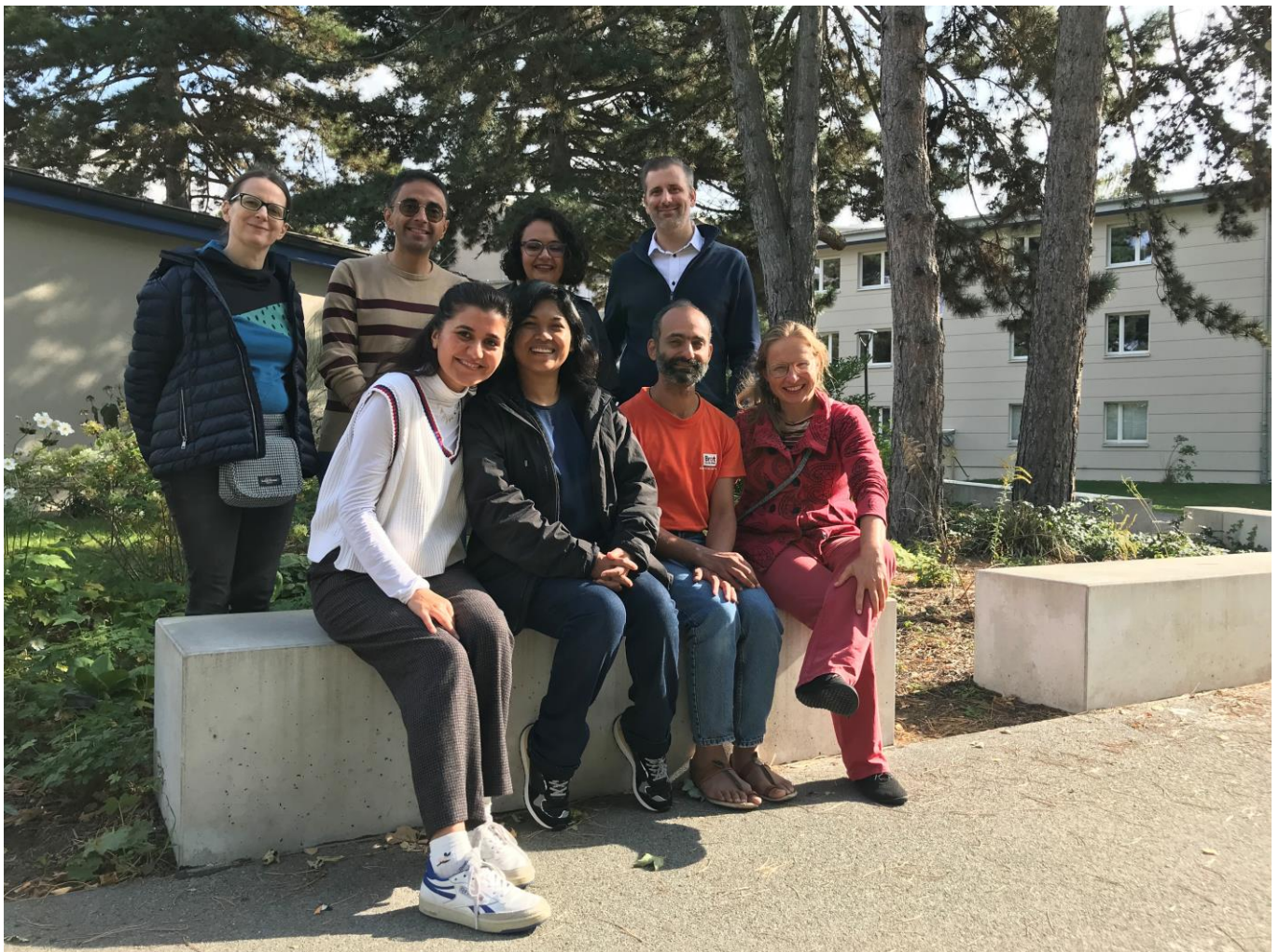
Executive Team meeting in Berlin in October 2023