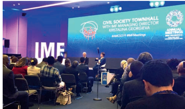
Managing Director of the IMF Kristalina Georgieva listening to CSO recommendations at the IMF Annual Meetings 2019.

The number of civil society organizations that work in the field of global financial stability is small. Therefore, in order to have political influence, it is important that those civil society organizations join forces with academics and other experts that work on topics of international financial architecture and related issues from North and South. It is just as important to make the public aware of possible dangers emerging from the growing political influence of the financing sector. The public should understand some of the impacts of the complex economic topics. Citizens should be aware of the devastating effects those economic consequences could have on their lives. That is why there is the need to boil down language to a level that is easily understood by the broad public so that dangerous finance products can be detected and addressed.