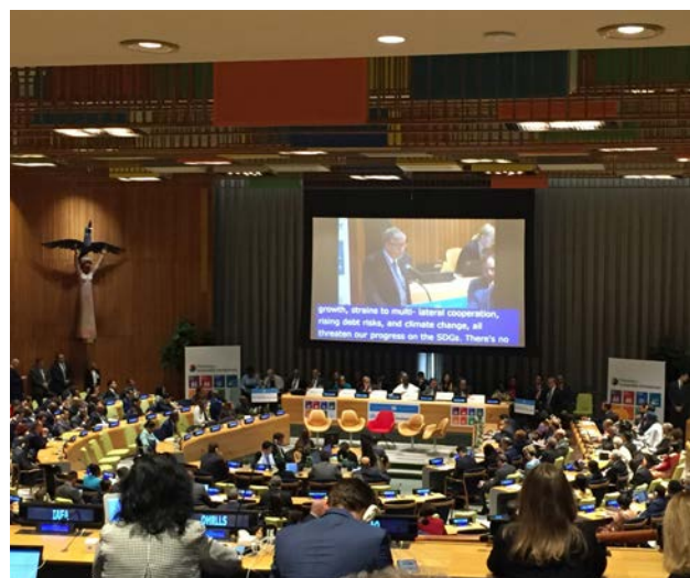
UN Trusteeship Council: Governments and representatives of the IMF, World Bank, civil society and the private sector annually meet at the UN Financing for Development Forum in New York City, USA.