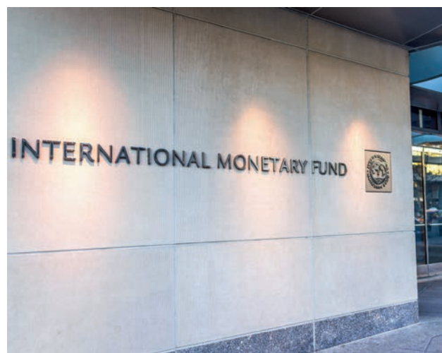
Headquarters of the IMF based in Washington D.C., USA.