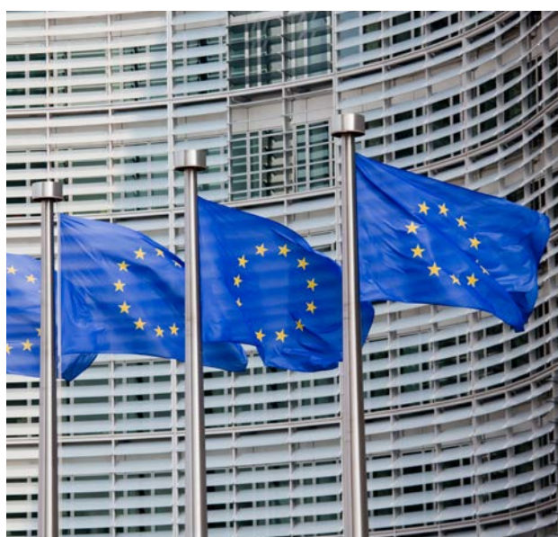
European Commission in Brussels, Belgium. CSOs are meeting regularly seeking dialogue with EU representatives.