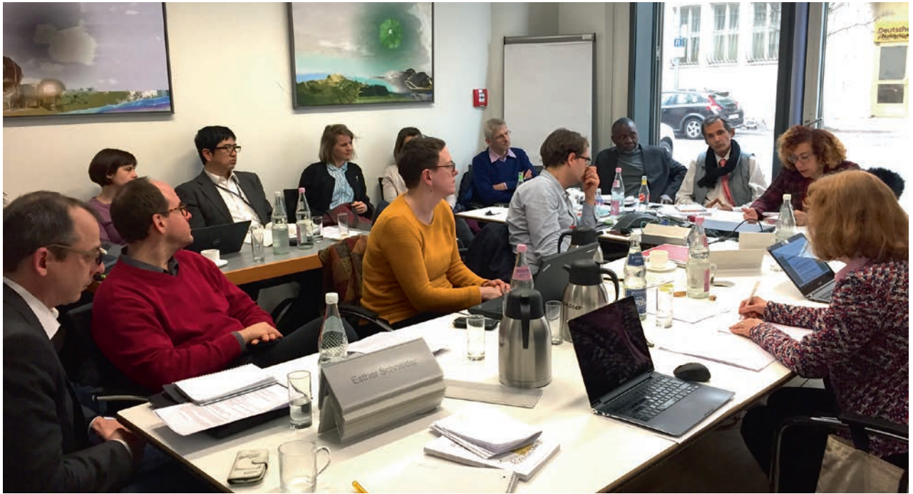
International Civil Society Expert Meeting 2019 in Berlin with the aim to consider joint lobbying strategies for the international meetings at the IMF, World Bank, UN and G20.