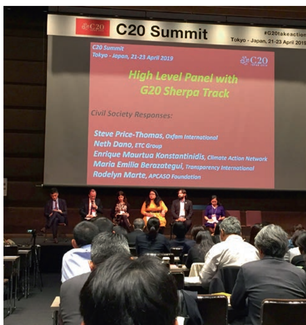
Around 400 international CSO representatives discussing their recommendations with G20 sherpas at the Civil 20 Summit 2019 in Tokyo, Japan.

Bearing in mind that G20 and the Civil20 are global spaces, local and international organizations that wish to discuss issues on the global agenda with an impact on the G20 are invited to participate in the Civil20. The IFA recommendations are also specifically addressed to the G20 Ministers of Finance and Governors of Central banks, who meet separately from the G20 summit of heads of state. For further information about the Civil20, its working groups and participation: https://civil-20.org/