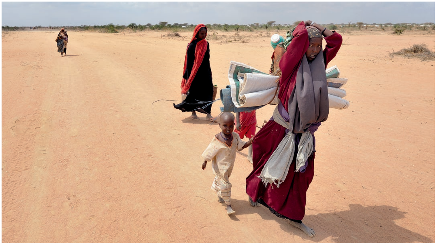
Tens of thousands of people have fled from drought and war to Dadaab, the world's biggest refugee camp in Kenya

With its organisations and facilities, Diakonie Deutschland has decades of experience with refugee welfare work. Its refugee services primarily consist of advice centres: Diakonie has over 500 programmes across the country for asylum-seekers and people who have exceptional leave to remain on a temporary basis (Duldung). These centres concentrate mainly on giving impartial advice on the asylum procedure and social questions, psychosocial counselling and psychotherapy, as well as social work with refugees in the local communities. With a total of 14 locations, Diakonie Deutschland is in charge of more than half the psychosocial centres for refugees of all German welfare