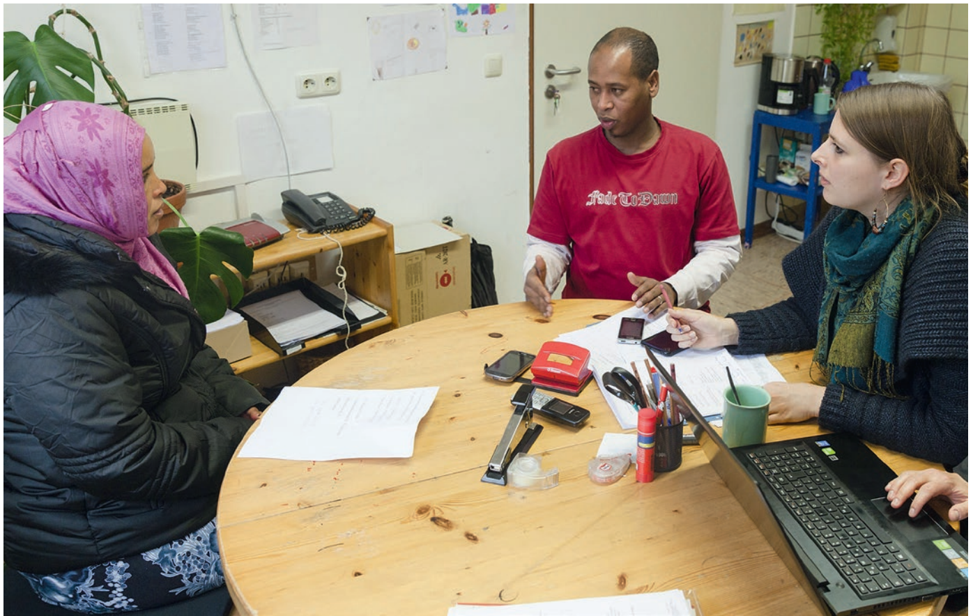
Advice for asylum-seekers regarding their asylum application in the initial reception centre for refugees located within the Protestant deanery in Hesse

associations. Other areas include the clearing procedure for unaccompanied refugee minors, accommodation facilities for asylum-seekers and accommodation referral offices, not to speak of the community and project activities of specialist migration services. In addition, Diakonie staff coordinate the large number of volunteers. According to the latest estimates, 3000–5000 staff members are concerned with refugee work in church-related and diaconal services and about ten times as many volunteers. In the last few months church funds amounting to millions of euros have been allocated to create additional positions in the field of refugee welfare. Good coordination by staff is needed to make the most of the assistance offered by volunteers.