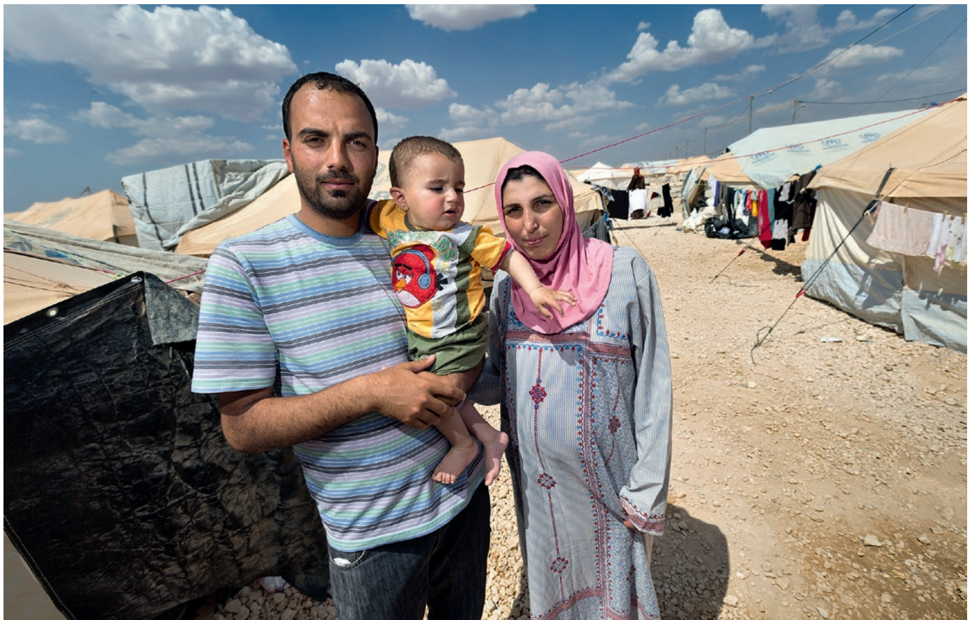
In Jordan Diakonie Katastrophenhilfe provides refugees from Syria with basic necessities

In spring 2012, a few days after the start of the war in Syria, Diakonie Katastrophenhilfe launched its aid programme for people who had been displaced due to the heavy fighting in Syria or were seeking protection in the neighbouring countries Jordan, Lebanon, Turkey and Iraq. According to the UNHCR, about 85 percent of refugees in the states around Syria live outside the official camps. Many countries have used up their reserves. Many refugees were witnesses of violence and are seriously traumatised. They are accommodated in tents, garages or in rented accommodation. It is a special challenge for local aid workers to reach these people with vital aid supplies. It is not only the refugee population that suffers. Over the years, the population of the