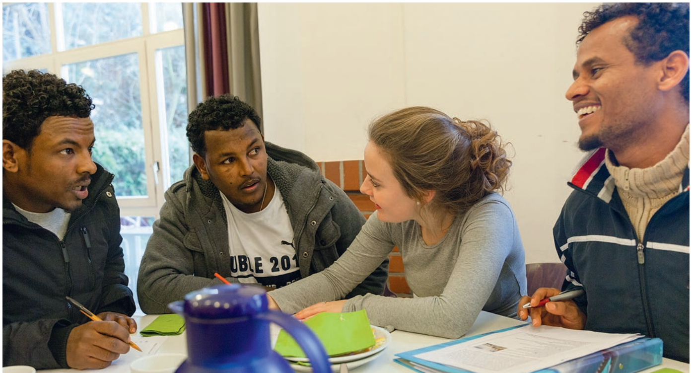
Volunteers like these enthusiastically practice speaking German with refugees in the Ecumenical Refugee Service in Bad Soden

instrument of migration policy. Political lobbying takes place at the local, regional, federal and European levels. Diakonie is a member of the Churches' Commission for Migrants in Europe (CCME) and the European Council on Refugees and Exiles (ECRE).