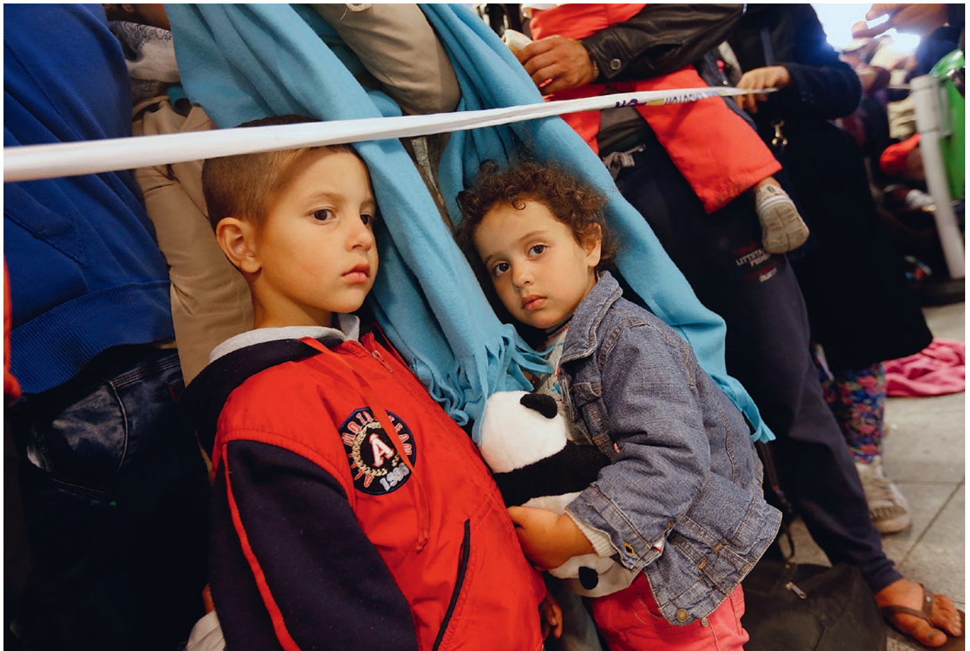
Refugees from Syria and Afghanistan wait in Budapest's Keleti Railway Station to continue their journey to Austria and Germany

Hence Bread for the World and its partner organisations advocate for two goals: on the one hand to enable people to choose to remain in their regions of origin. Peace education projects such as in the Eastern Congo make an important contribution to this. On the other hand, Bread for the World contributes to improving the protection, plus the legal and practical situation of migrants in the countries of transit and destination.