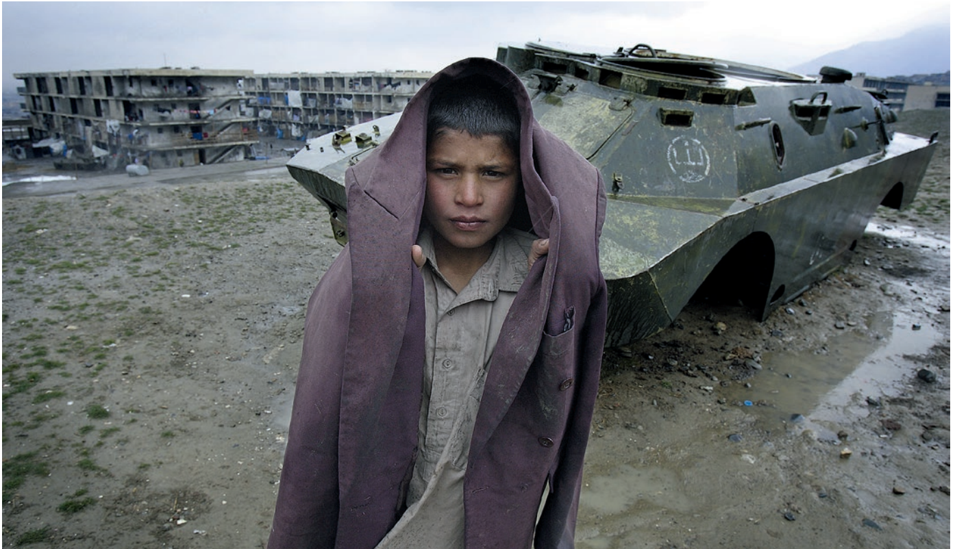
More and more people are fleeing their home countries to escape from violent conflicts

An assignment for three: working with refugees. Bread for the World, Diakonie Katastrophenhilfe and Diakonie Deutschland work for refugees and migrants under the umbrella of the Protestant Agency for Diakonie and Development.