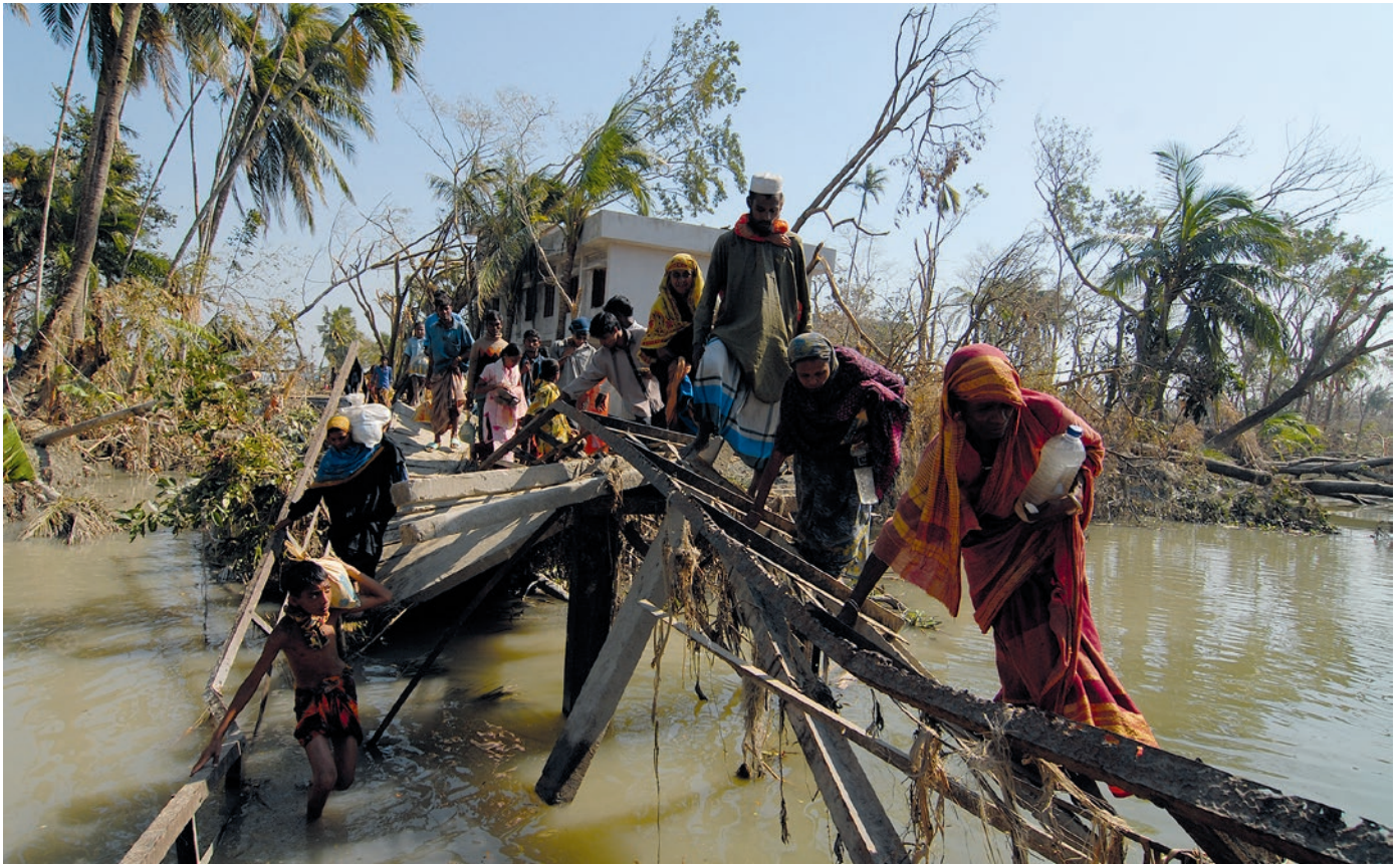
In view of rising sea levels, and more storms and floods because of climate change, these people in Bangladesh are leaving their homes and seeking refuge in the capital Dhaka

The Universal Declaration of Human Rights includes the right to freedom of movement. Article 13 states: “Everyone has the right to leave any country, including his own, and to return to his country.” Development, too, is regarded worldwide as a legitimate goal, whereas the use of development opportunities through migration is often criminalized.