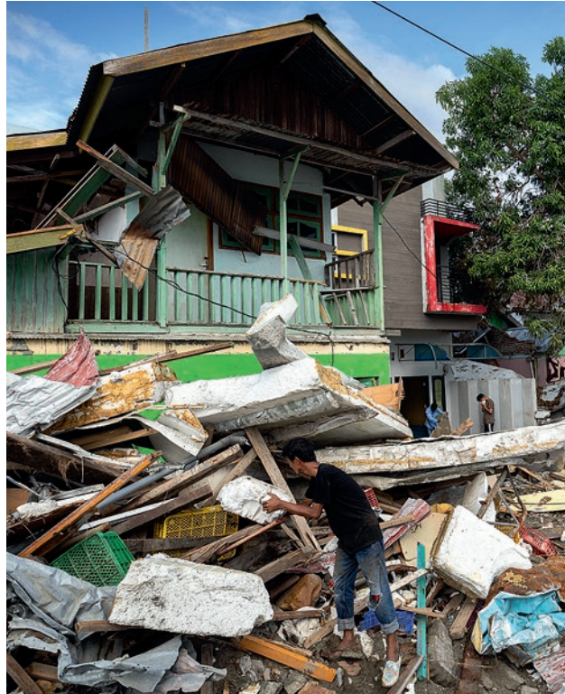
New financing mechanisms are required to ensure social protection floors, especially in times of disasters as after the tsunami in Sulawesi, Indonesia.

donor countries towards reaching the official development assistance (ODA) target of 0.7 per cent of gross national income (GNI) – even though it is not sufficient to tackle the causes of global inequality that are to be found, among other things, in structural political and economic imbalances that enable these excessive inequalities in global living standards to emerge in the first place. Tackling these systemic causes will require much deeper structural changes that alter the primary distribution of resources among countries before any efforts of redistribution are even undertaken.