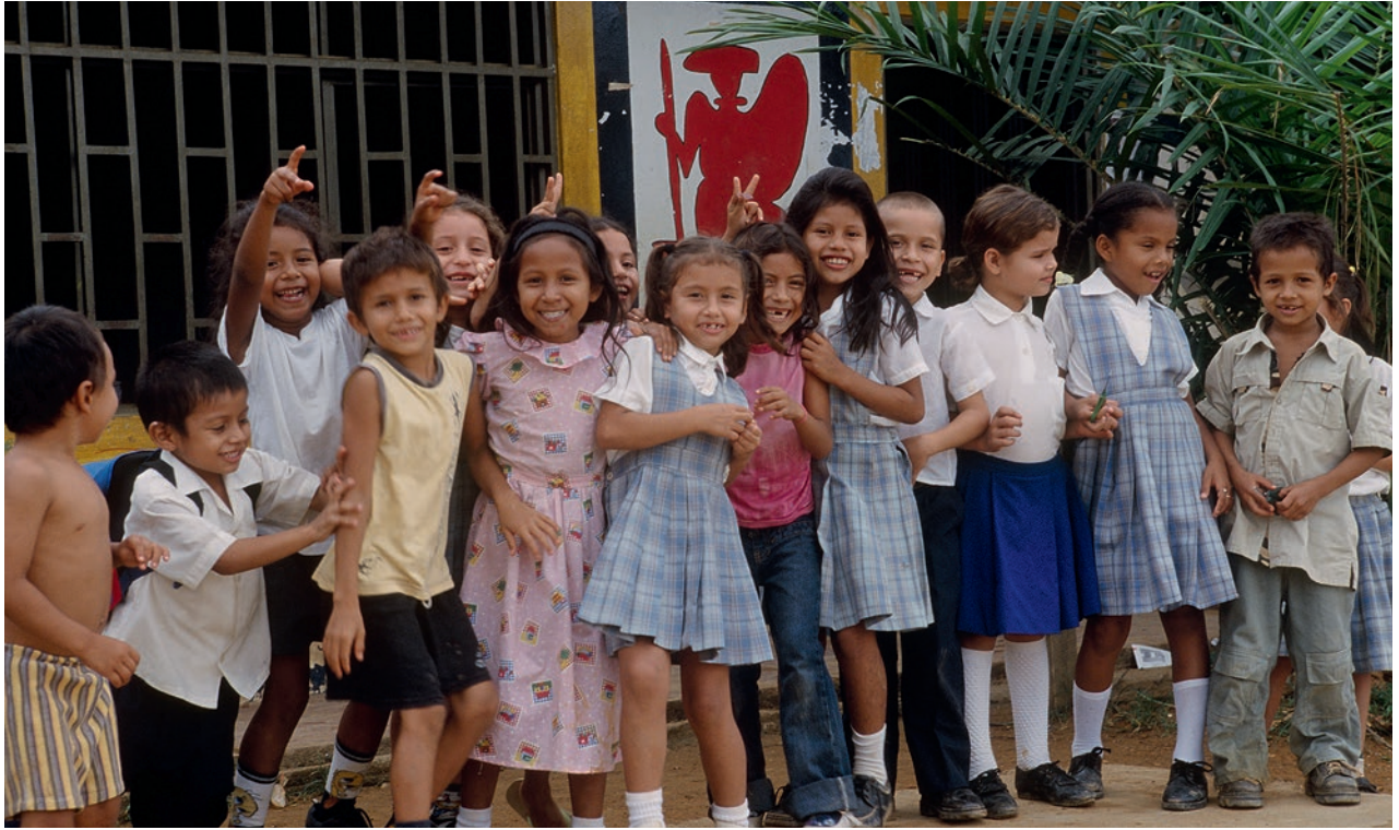
Public services in the field of education have huge redistributive impacts. They also allow primary school children – here in Colombia – to improve their own starting position.

are not confined to narrow groups but are granted to all individuals that meet certain criteria, such as having children or being disabled, regardless of their own means. Prime examples of this include universal child grants, social pensions for everyone above a certain age threshold or proposals of a universal basic income. In principle, universal benefits are rights-based and reduce inequality by design: if everyone in an unequal society gets the same transfer, the spread in incomes will be reduced. In practice, their impact depends on the size of the transfer and will likely be smaller than that of targeted assistance since the latter ideally facilitates redistribution from the top to the bottom and, given the same budget, can be larger in size. For this reason, proponents of targeting argue that fiscal space – especially in countries with a tight budget constraint where high-income earners often do not pay a fair share of taxes – is limited. In this sense and notwithstanding its critique, targeting provides means of channelling resources to those most in need and maximizing redistributive impact at lower costs. According to political economy arguments, universal